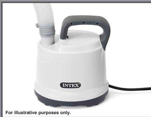
For illustrative purposes only.

POOL DRAIN PUMP Model DP30220 220 - 240V~, 50Hz, 99W Hmax 2.5 m, Hmin 0.01 m, IPX8